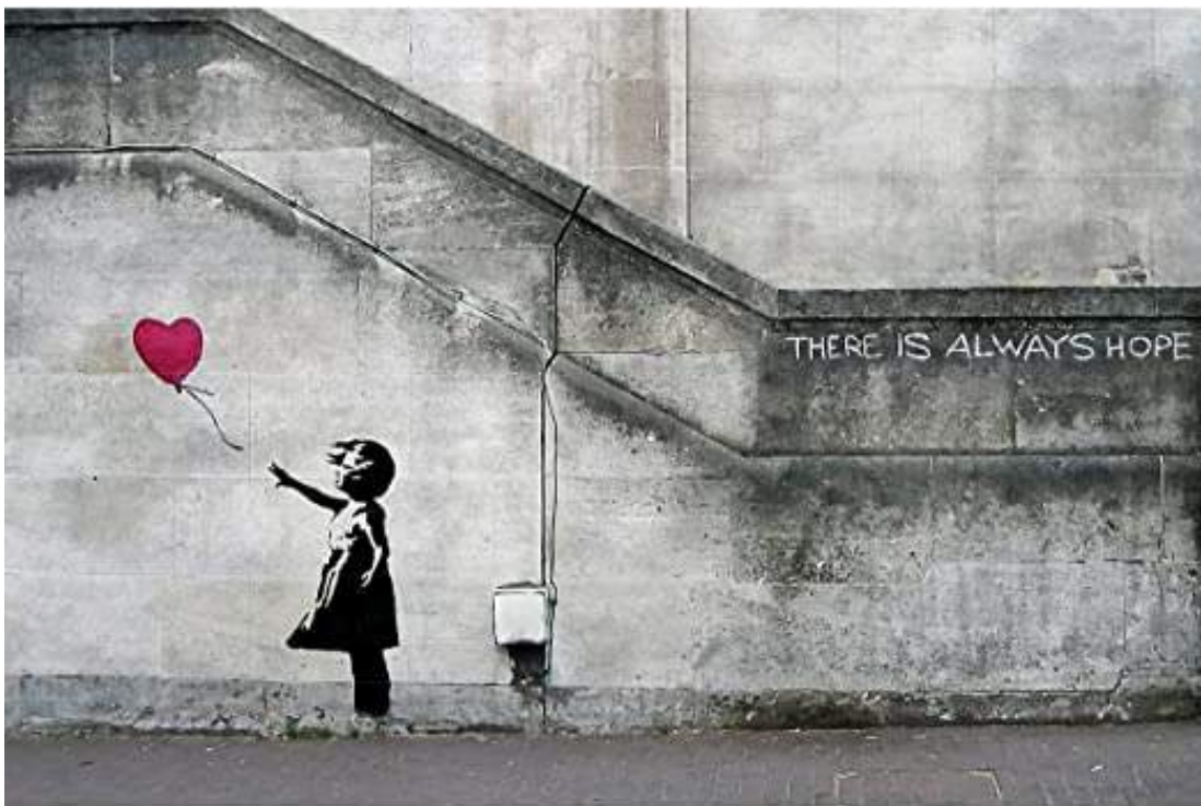
BANKSY 2002 South Bank Mural 'There is always hope'.

UA Fanthorpe, from Safe as Houses (Peterloo Poets, 1995)